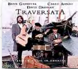
Traversata Acoustic, 2001