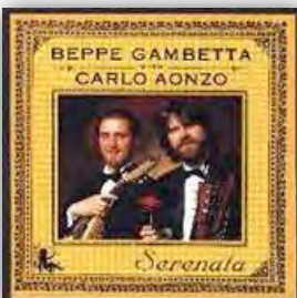
Serenata Acoustic Music Records, 1997