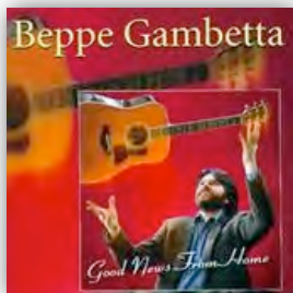
Good News From Home Green Linnet, 1995