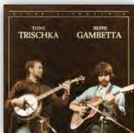
Alone and Together Brambus, 1992