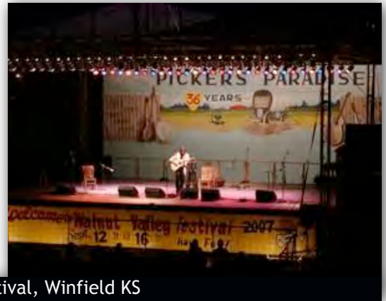
Walnut Valley Festival, Winfield KS