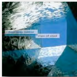
Four Way Mirror Gadfly Records, 2006