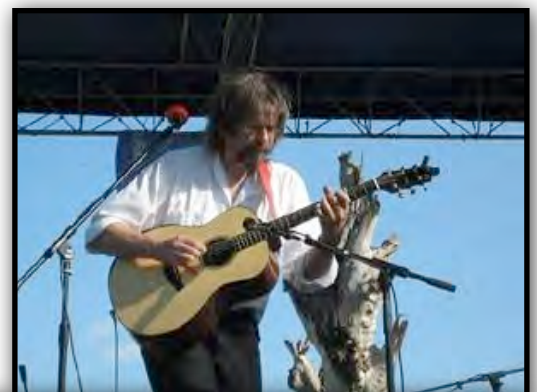
Oklahoma International Bluegrass Festival, Guthrie OK

Teatro della Corte, Genova, Italy Teatro Carlo Felice, Genova, Italy Teatro delle Erbe, Milano, Italy Mosebacke, Stockholm, Sweden Auditorium RAI, Sala A, Roma, Italy Continental Club, Budapest, Hungary Mahogany Hall, Bern, Switzerland The Basement, Sidney, Australia Teatro La Comedia, Buenos Aires, Argentina Auditorio Angel Bustelo, Mendoza, Argentina Aula Magna Dante Alighieri, Rosario, Argentina Metropolitan Museum of Art, New York, NY Ryman Auditorium, Nashville TN Nashville Chamber Orchestra, TN Philadelphia Museum of Art, Philadelphia PA Patriots Theatre, Trenton, NJ