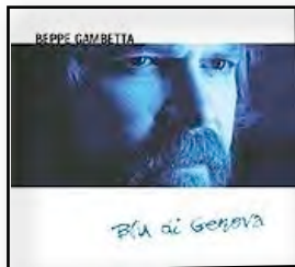
Blu di Genova Gadfly Records, 2003