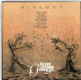
Dialogs Brambus, 1988