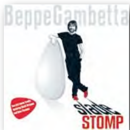
Slade Stomp Gadfly Records, 2006