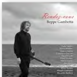
Rendez-vous Gadfly Records, 2008