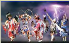
KL Native Dance Ensemble