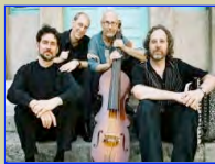
Brave Old World