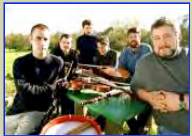
Llan de Cubel