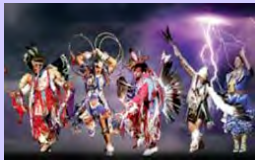
KL Native Dance Ensemble