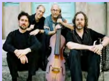
Brave Old World