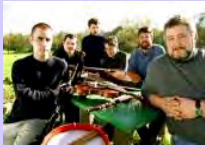
Llan de Cubel